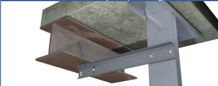
Custom VertiClip® SLS (extra long)

Retrofit situation where a stud does not run full height, creating a situation where a modified VertiClip SLS was lengthened to bridge a large gap from the structure of 26".