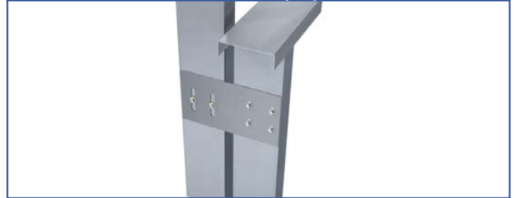
Custom VertiClip® Splice

Connector for parallel wall studs. One stud rigidly attached to wall stud. The other stud accommodates vertical deflection of the primary structural frame.