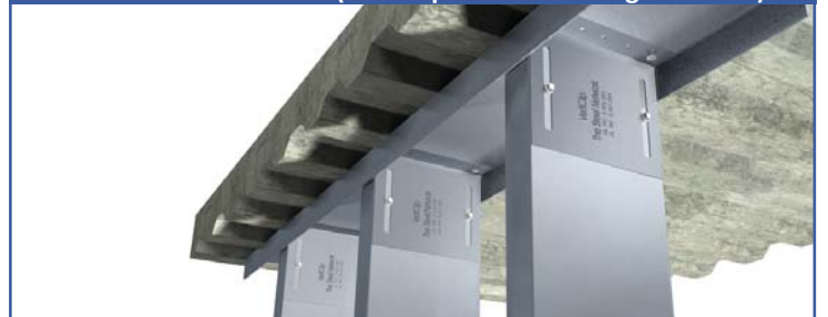
Custom VertiTrak® VTD (VertiClip® SLD with Elongated Slots)

VertiTrack VTD modified to accommodate 4" slots in VertiClip SLD provides an effective, efficient solution for large demising walls typically seen in retail stores and theaters.