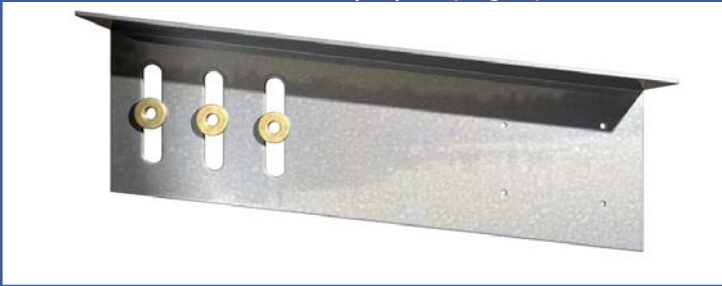
Custom VertiClip® Splice (Angled)

Unique condition brought to TSN by Specialty Engineer. TSN helped design a solution and test & fabricate clips.