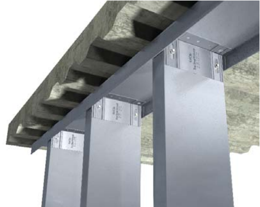
US Patents #5,467,566 & #5,906,080