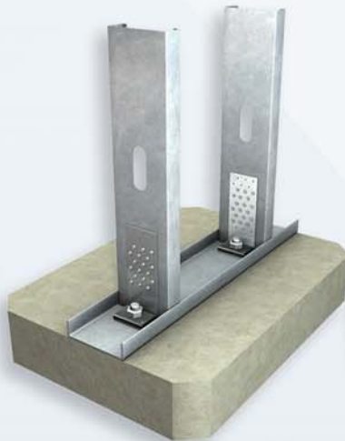
Steel Stud Tie Down