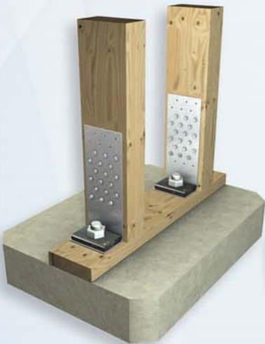
Wood Stud Tie Down