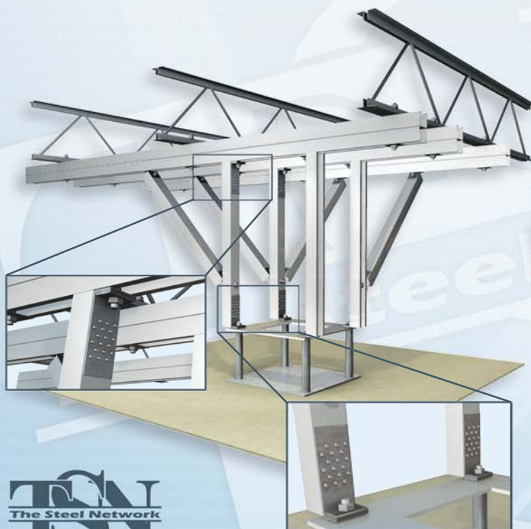
Medical Equipment Anchor