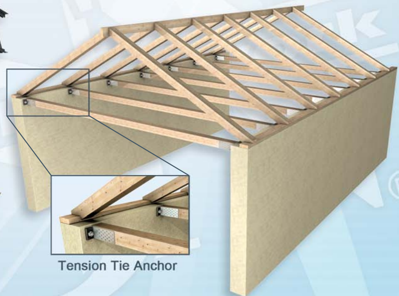
Tension Tie Anchor