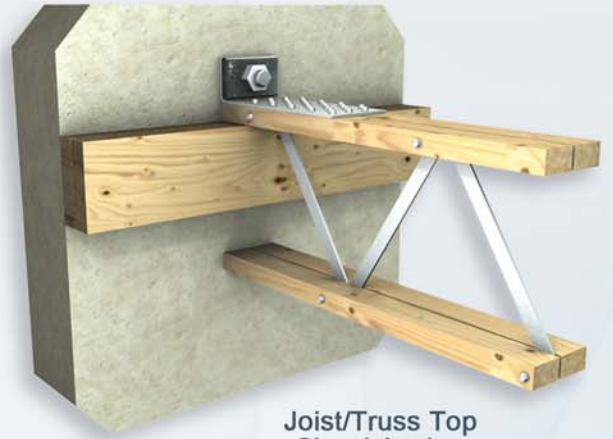
Joist/Truss Top Chord Anchor

The StiffClip TD series' unique design allows for the anchoring of wood or steel studs to the foundation. Pre-drilled holes for attachments to both deck and stud provide installers with increased efficiency. StiffClip TD resists vertical uplift loads for an effective solution in wall stud tie-downs or as the anchorage component in many other framing applications.