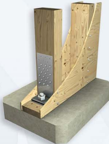
Shear Wall Column Anchor (Wood Framing)