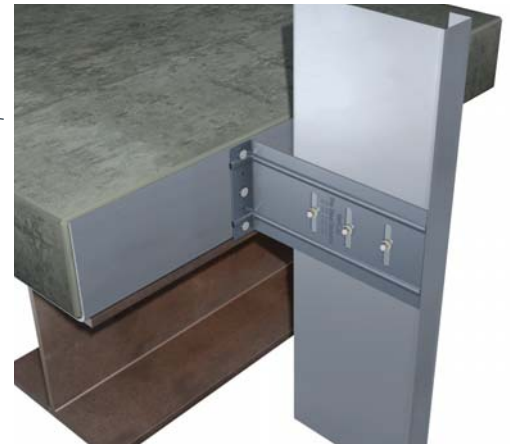
US Patents #5,467,566 & #5,906,080