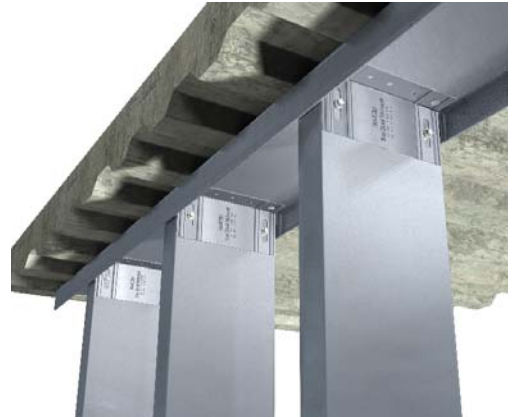
US Patents #5,467,566 & #5,906,080