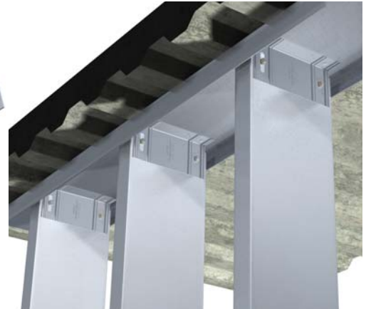
US Patents #5,467,566 & #5,906,080

The attachment of VertiTrack to the primary structure may be made with PAFs, screw/bolt anchors or weld and is dependent upon the base material (steel or concrete) and the design configuration.