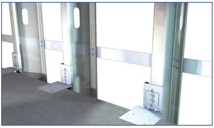
VertiClip SLF used with one flat strap bracing on the outer flange of studs to resist torsional effects.