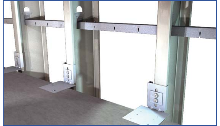
VertiClip SLF used with TSN's BridgeBar® & BridgeClip® installed within 12" from the clip.