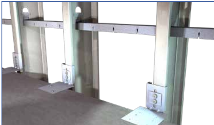
VertiClip SLF used with TSN's BridgeBar® & BridgeClip® installed within 12" from the clip.