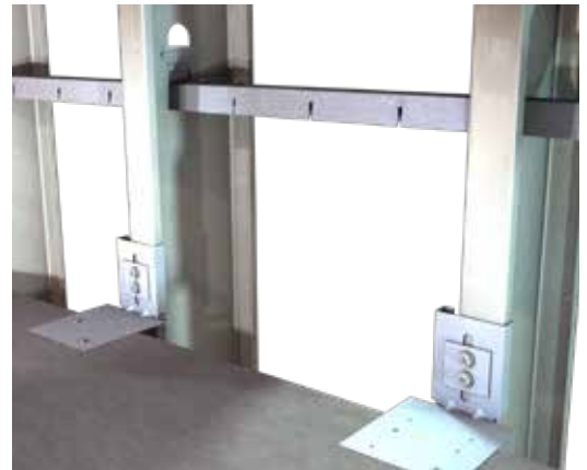
US Patent # 8,511,032