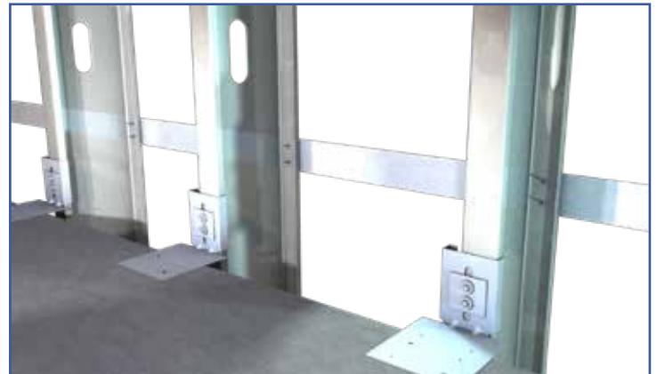
VertiClip SLF used with one flat strap brace on the outer flange of studs to resist torsional effects.